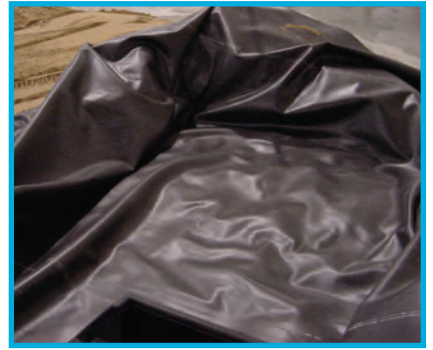
The liner covers the stream bed and goes thru the area where the spillway will set.

Once you have sculpted the reservoir, stream and waterfall area carefully check for any rocks, roots or sharp objects in the soil. After ensuring the area is free from objects you can install the underlayment thru the reservoir and stream area. After installing the underlayment you can install the liner as well. Do not be concerned with a few wrinkles in the liner since the whole area will be filled in with rock and covered. Be sure to pull any extra liner towards the waterfall area.