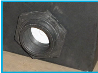
Photo shows bulkhead fitting and plug installed in the end of the spillway.

If your spillway came assembled, remove the plastic grating from the top of the spillway. There are openings on both ends of the spillway for water to enter. You will need to decide which end is more convenient for your application. First you need to plug the opening you will not be using. Install the bulkhead fitting with the body and the rubber gasket on the inside of the tub. Tighten the plastic washer and the nut from the outside. Install pvc plug on the inside of the tub and tighten. If you are using a large spillway often times water will come in from both ends in which case you would not use the plug but rather install a pvc male adapter on the outside of the bulkhead.