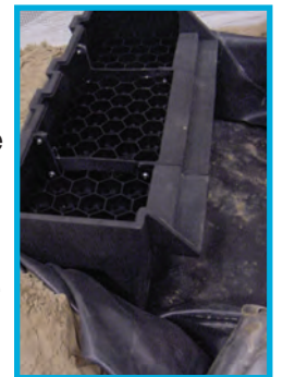
The liner goes under the spillway and wraps up the back and ends.

The above instructions provide you with a water tight penetration through the liner. There is also a way to connect the water pipe to the spillway without penetrating the liner. To do this you would install the bulkhead in the spillway and turn the male adapter into the bulkhead. Next install 90° elbow onto the male adapter. Glue your flex PVC pipe into the elbow. The liner then wraps up around the pipe and elbow up against the spillway box. The flexible PVC pipe then runs down the stream on the inside of the liner back to the pond. The hose will be hidden by the rocks used in the stream bed. Keep the hose tight along the edge of the stream where larger rocks are used, not in the middle where small gravel is used.