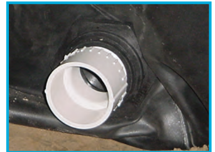
Bulkhead is thru liner, washer and nut are tightened and PVC adapter is installed.

On the incoming side you will need to hold the liner up to the end of the tub and mark where the bulkhead hole is. Cut a hole in the liner slightly smaller than the opening. Set the spillway tub in place and push the body of the bulkhead thru from the inside (be sure rubber gasket is in place inside the tub). Stretch the liner over the bulkhead and then install the washer and the nut. Tighten the nut snugly but do not overtighten. This will create a waterproof seal thru the liner.